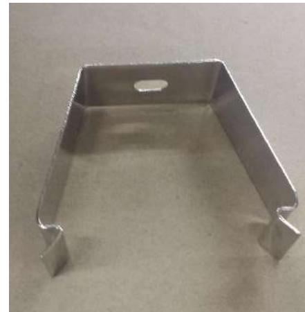
Fig 1 - Bracket

*All local and International wiring laws/guidelines should be followed by a competent person.