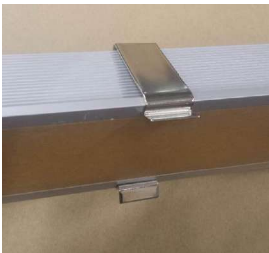
Fig 2 & 3